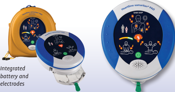
Integrated battery and electrodes